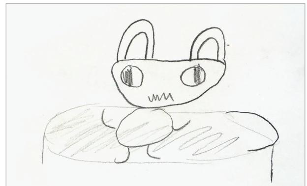
Rabbit & Bath